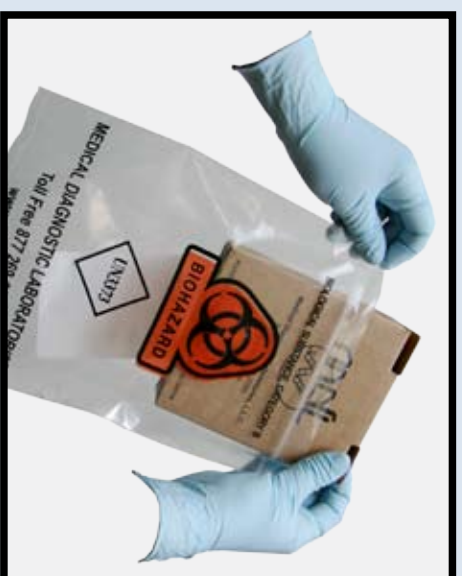
Insert the mailer into biohazard bag.