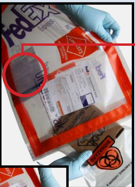
Remove FedEx receipt inside Lab Pack for your records.