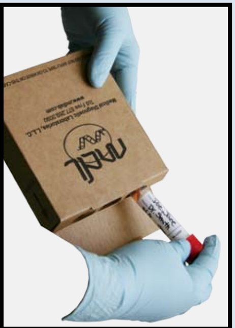
Insert labeled vial into mailer