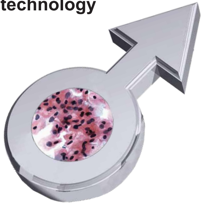
Classification of HPV types